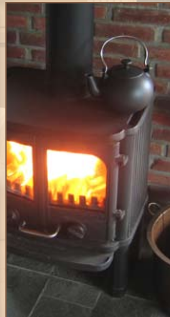
Use for stoves