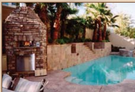
Use for outdoor BBQs