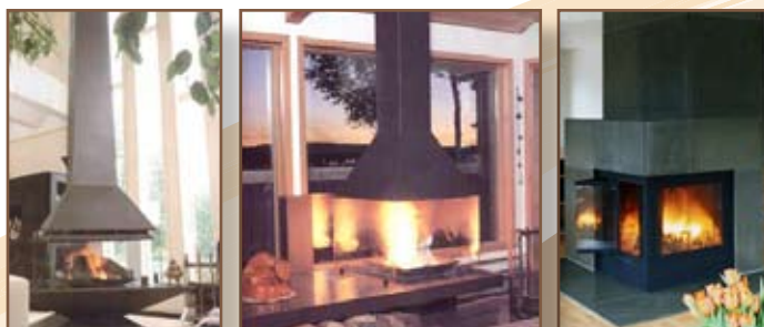
Unconventional fireplaces tend to cause smoke problems