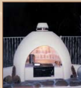
Shown on an outdoor BBQ

The EXHAUSTO Chimney Fan can be used with wood or gas-fired fireplaces, stoves, baking ovens, BBQs, furnaces, boilers, etc. And the chimney fans don't care whether the chimney is new or old, tall or low, thin or thick, brick or steel!