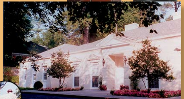
Moores Mill Road, Atlanta, GA