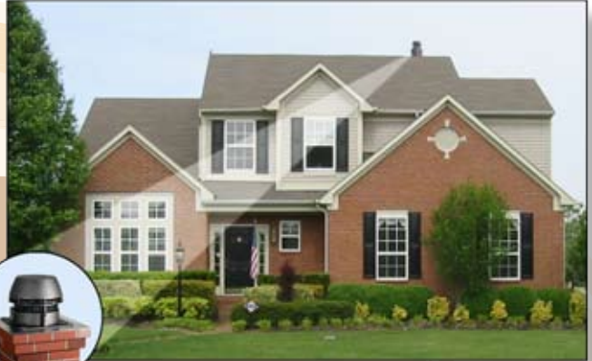
Barely visible on the chimney