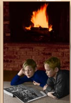
Comfort in the home

SIX MONTH UNCONDITIONAL MONEY-BACK GUARANTEE