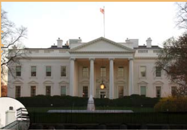
The White House, Washington, D.C.